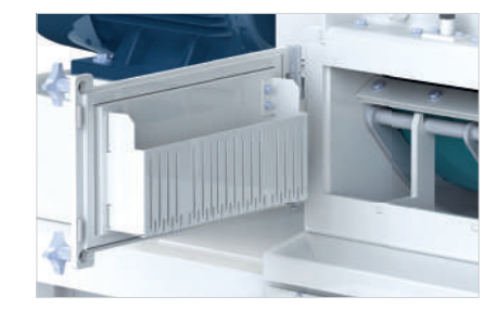
Door with foreign body catch trap