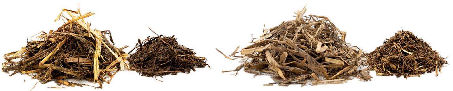
Solid manure and horse manure, before and after processing with Biomass Shredder BMS