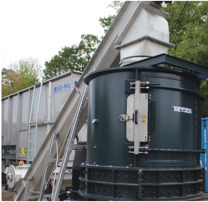
Setup of Biomass Shredder BMS and dosing system from Konrad Pumpe during intensive test period