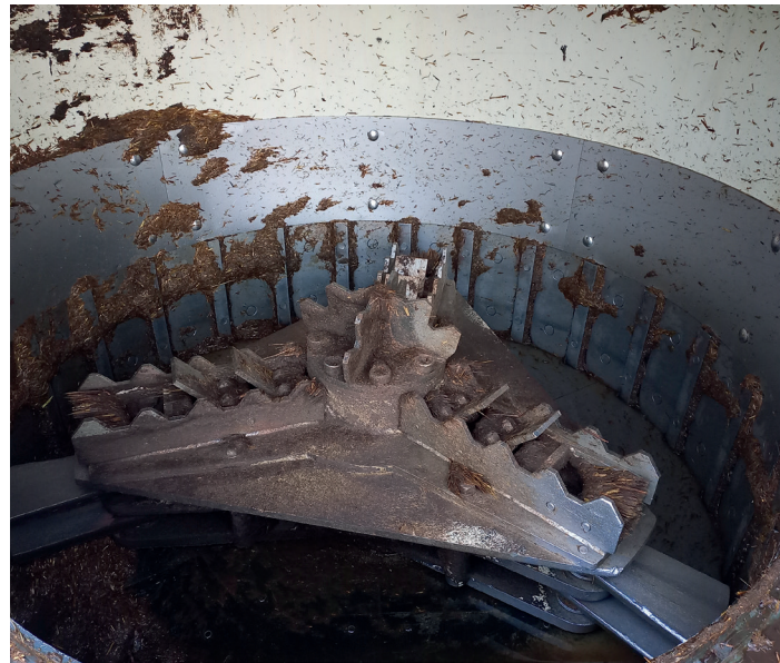
Biomass Shredder BMS: ripping combs for distribution of the material, impact parts and beaters made of wear-resistant materials such as Hardox and carbide

A closer look at the breakdown principle of the two technologies shows that the protective lignin layers on the outside of fibrous biomass are largely retained when simply cut. As lignin cannot be